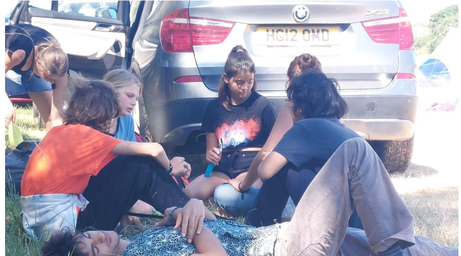
We do not have a photo of the youth gathering, so here is one of us instead

We are still in contact through a WhatsApp group. I hope we can stay connected and that it can become like a network of young people from around the world who care about changing the world and sharing about different ways of education.